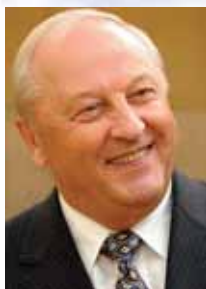
Eduard Rossel, Governor of the Sverdlovskaya region

For the participants of the RUS Estate Forum, there will be held a tour of Yekaterinburg City to acquaint them with the major backbone commercial real estate facilities, city development plans, its cultural and historical sights.